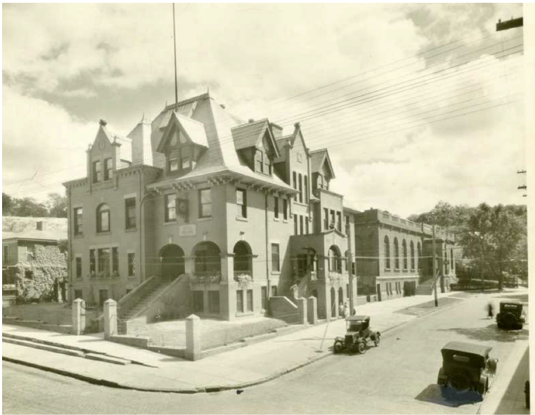
Figure 2. Alta House Social Settlement, original design